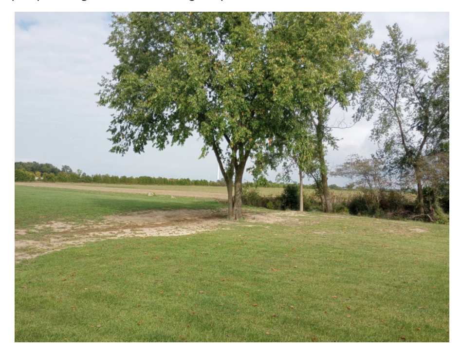
Subject property looking northeast at the location of covered drain