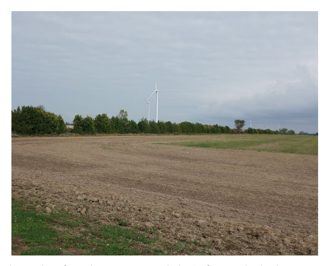
Looking northeast from subject property towards abutting farm parcel and Highway 401