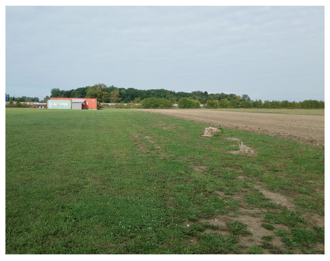
Subject property looking north towards Highway 401