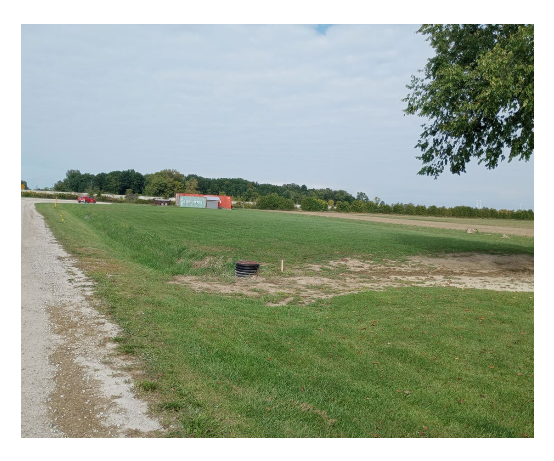
Subject property looking north towards Highway 401 at location of covered drain