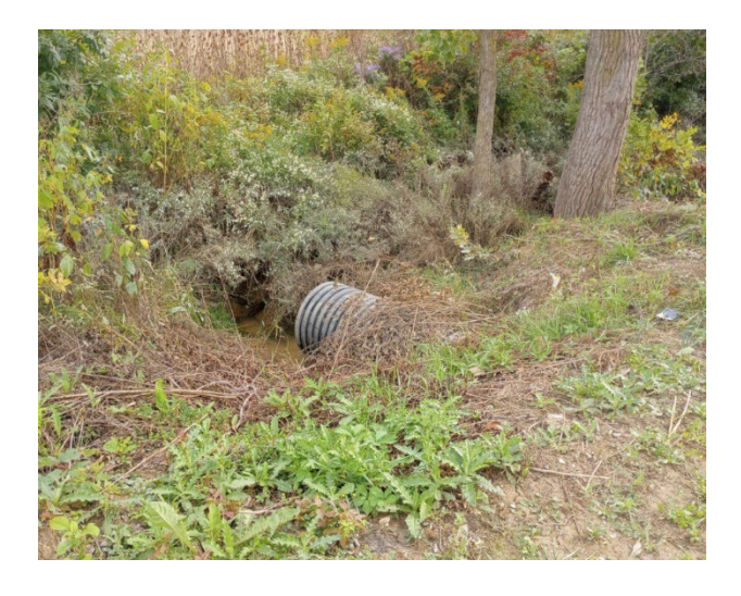
Looking at covered drain works on subject property near the rear lot line