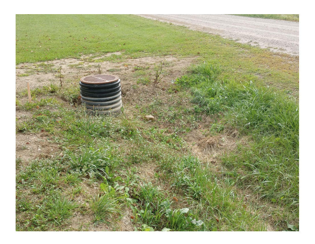
Looking at covered drain works on subject property near the front lot line