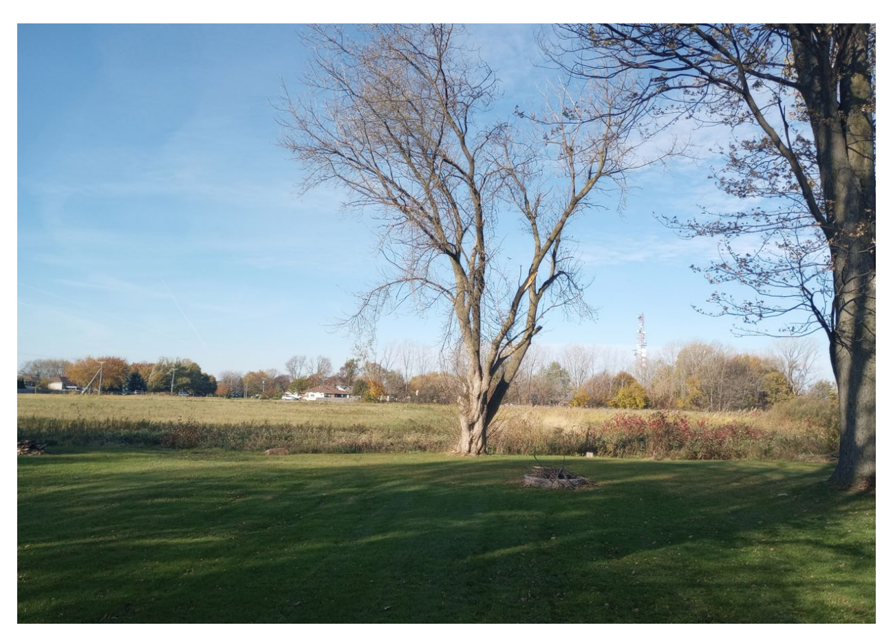
Looking at the vacant property west of the subject property from the subject property's rear yard