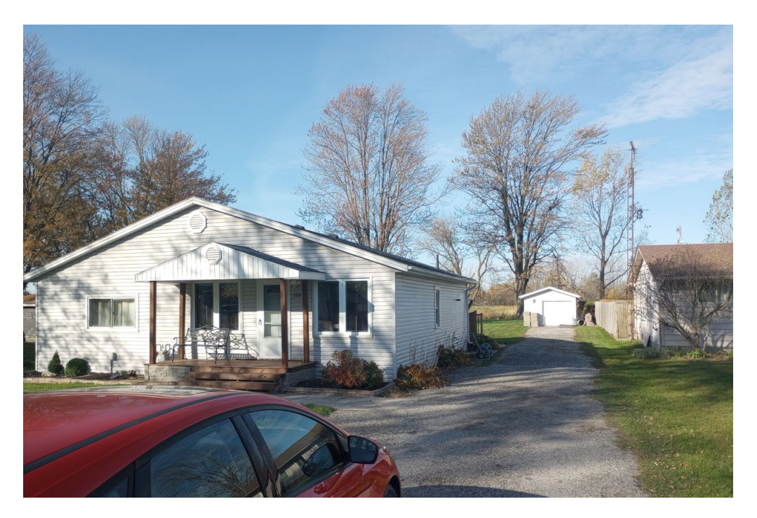
Existing dwelling and existing accessory building to be replaced (looking east)