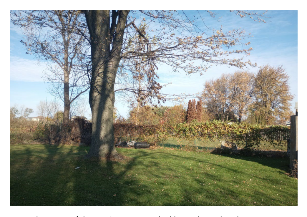
Looking west of the existing accessory building to be replaced