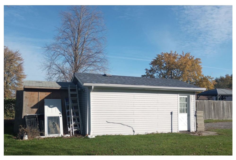
Existing accessory building to be replaced (looking north in rear yard)