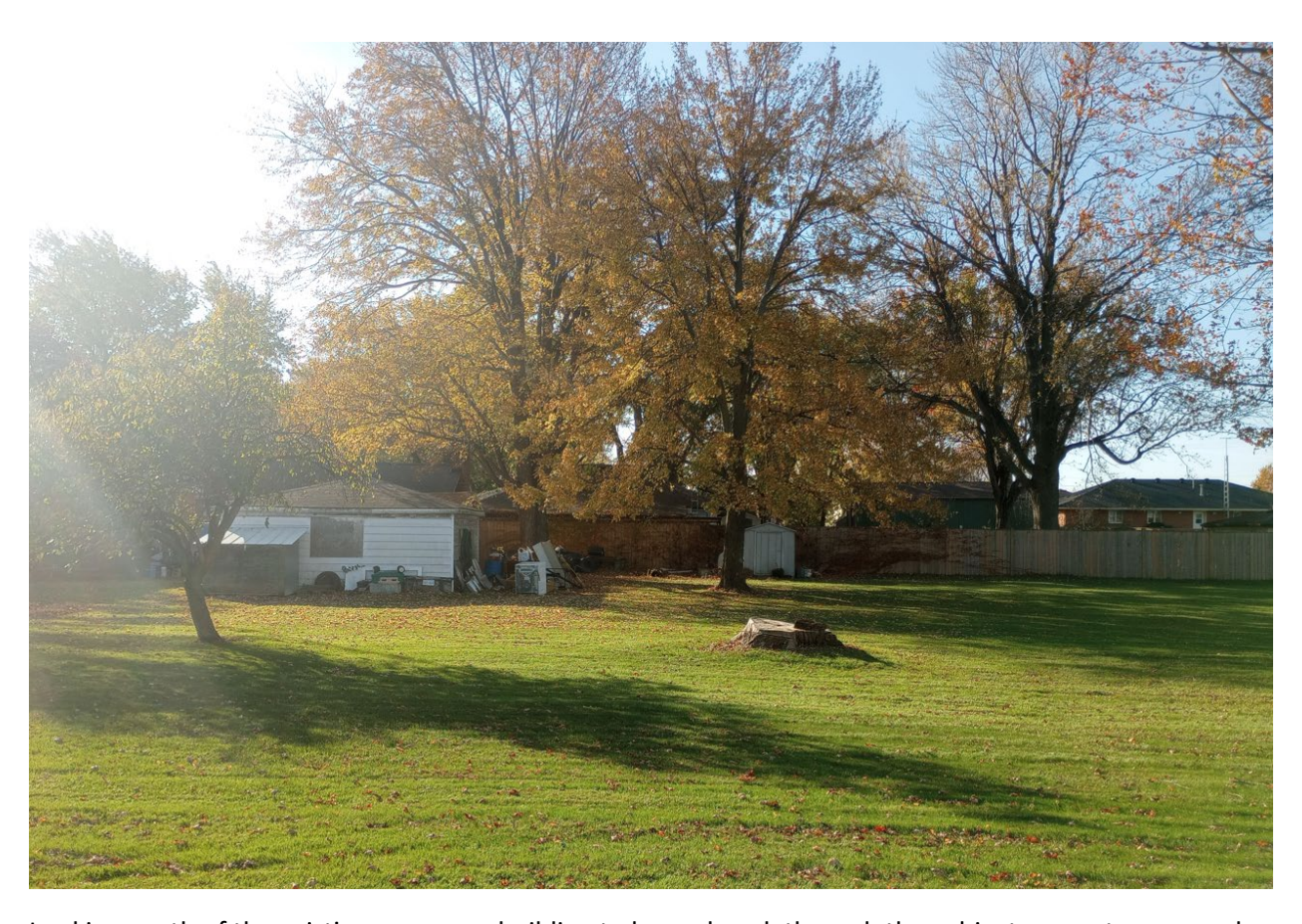
Looking south of the existing accessory building to be replaced, through the subject property rear yard and towards the southerly neighbours rear yard