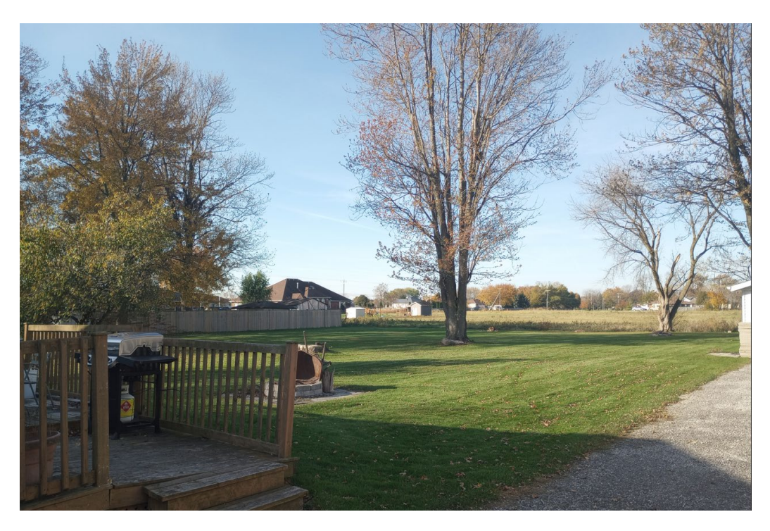
Looking at the part of the rear yard south of the existing accessory building to be replaced