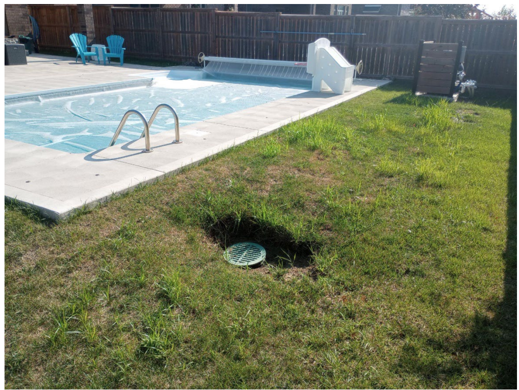
Figure 3: Existing drain in rear yard, located between pool and rear lot line.