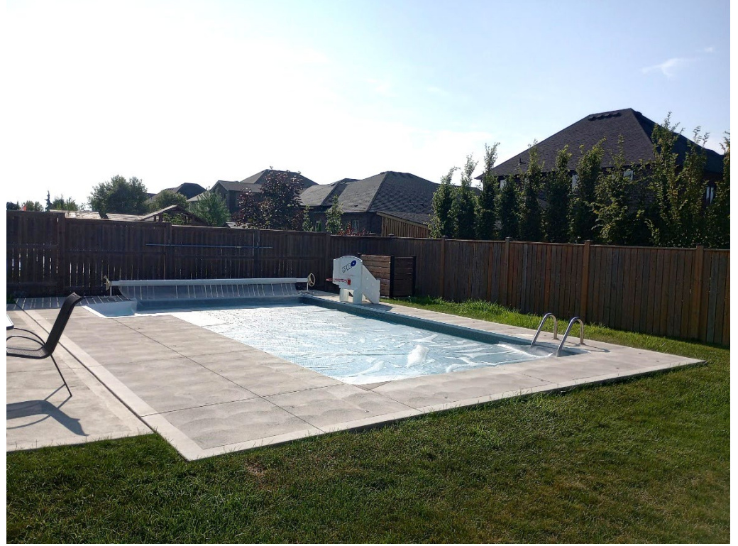
Figure 1: Southeast-facing view of existing inground pool in rear yard.