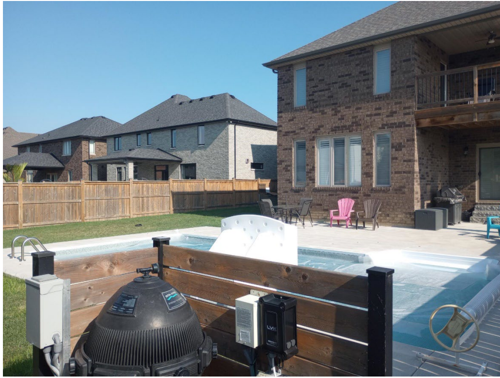
Figure 5: Existing pool equipment (to be moved), pool, and rear of dwelling, as seen from southeast corner of lot.