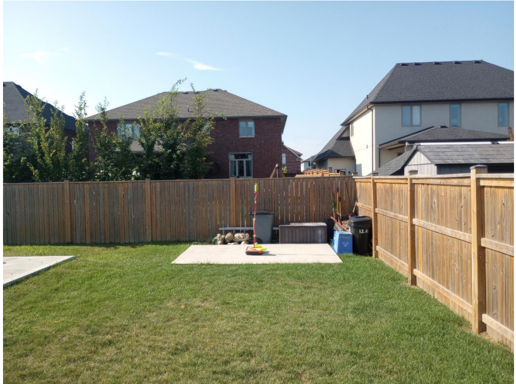
Figure 7: Existing concrete slab in southwest corner of lot, as seen from side yard facing south. Proposed to support future shed and relocated pool equipment.