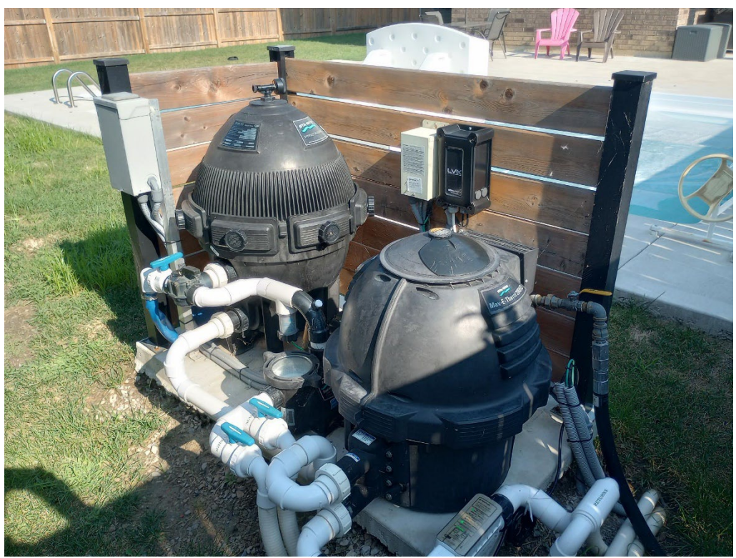
Figure 6: Existing pool equipment (to be moved) in southeast corner of lot.