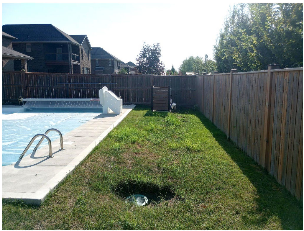
Figure 4: East-facing view of existing drain, pool, and pool equipment in southern portion of rear yard.