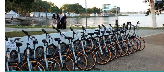
Example of Improved Marina Bike Service