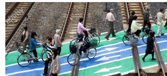
Example of Improved Railway Crossing