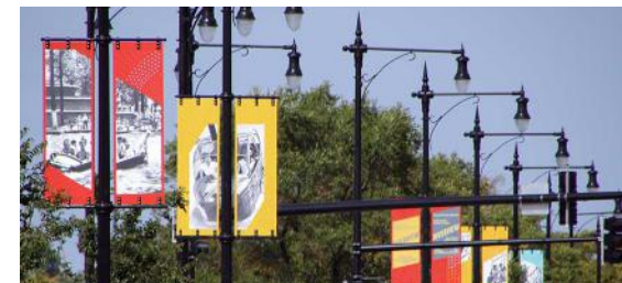
Example of Streetscape Pageantry