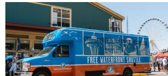
Example of Waterfront Shuttle Service