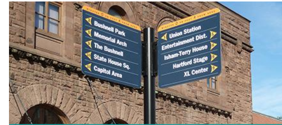
Example of Streetscape Way-finding