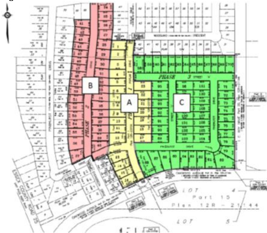
Figure 2: Revised Phase 3

In October of 2010, Council supported extending draft plan approval for another three year period as requested by the owner. The approval lapsed on October 20, 2010. The County of Essex supported the extension of draft plan approval with the new lapse date