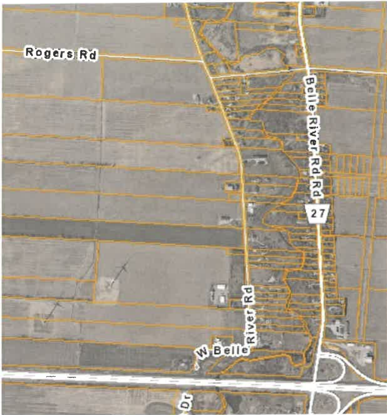
Excerpt: OP Schedule C1 (orange = Waterfront Residential Designation)