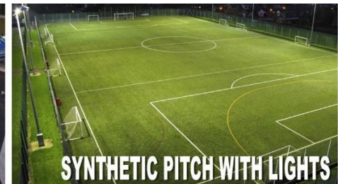
SYNTHETIC PITCH WITH LIGHTS