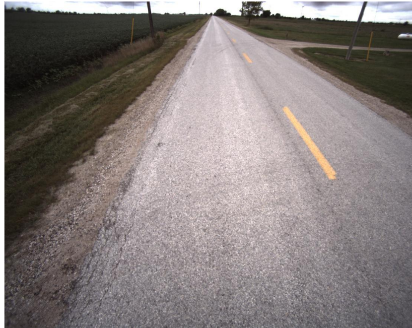
2018 Pre Condition

Lakeshore cannot maintain the use of these roadways as heavy truck routes.