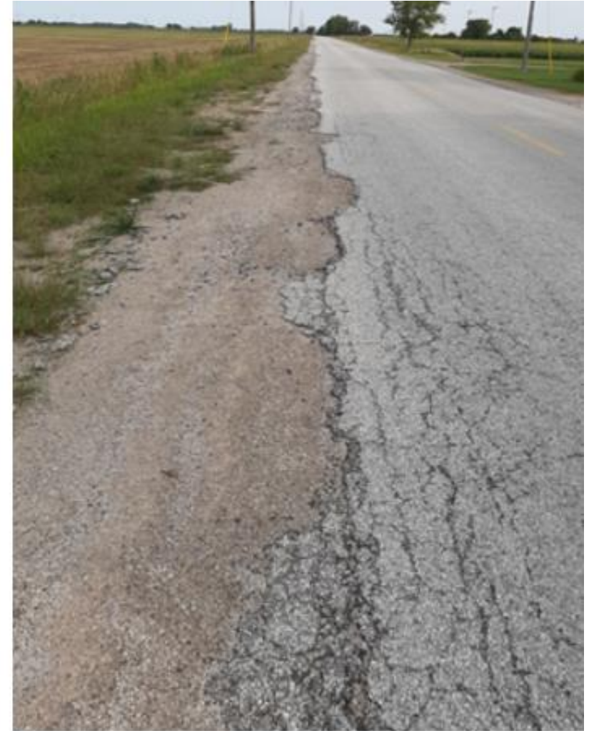
2019 Post Condition